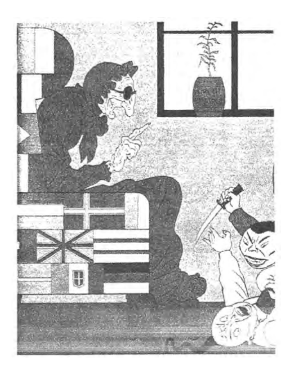
A cartoon published in Germany in January 1933. The League (on the left) is saying 'Naughty Japan! You should warn me next time you want to start a little war.'